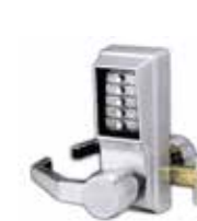
Mechanical digital lock

They are only available as fail unsecure (unlocked) and for this reason they are generally seen as low security solutions. They can be used on inward and outward opening door depending on bracketry used.