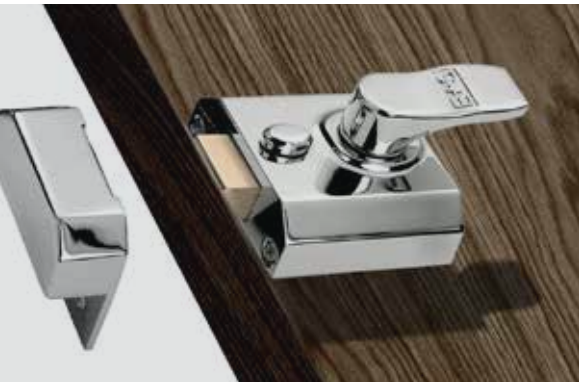
Cylinder rim nightlatch